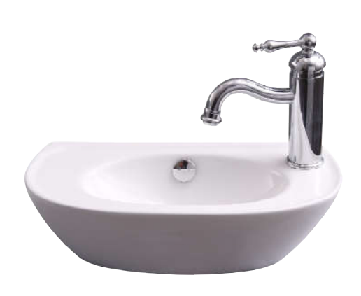
Faucet not included